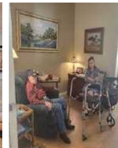
Just Friends Chatting