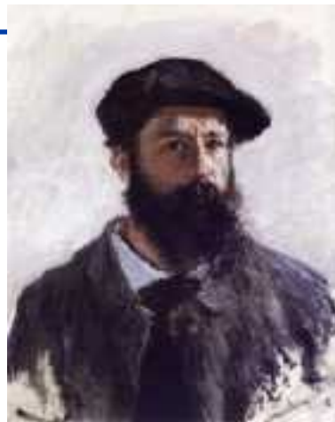
Self-Portrait, Claude Monet, 1886

Monet passed away December 5, 1926, in the city of Giverny, France.