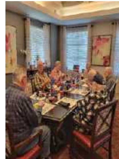
Celebrating our Veterans