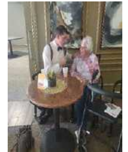
Everyone loves Brad