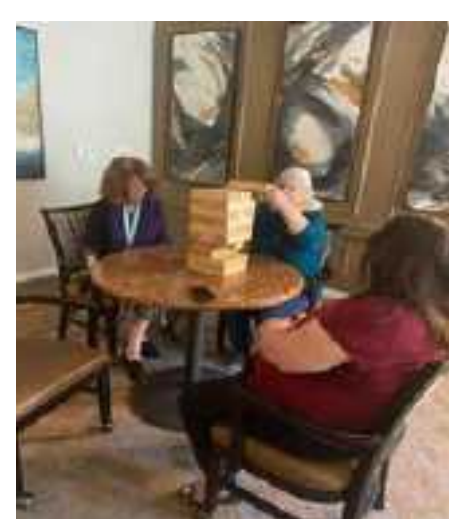
Giant Games Fun