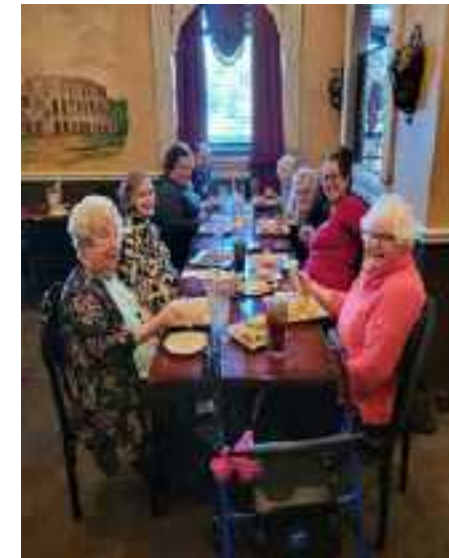
Café Italia Lunch